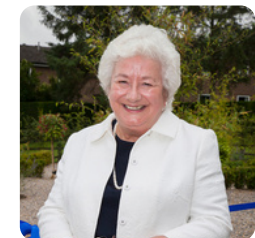
Baroness Harris of Richmond DL, PRESIDENT